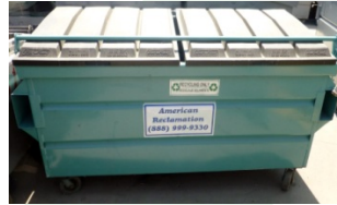
1.5 Cubic Yard

Size = 71" W x 30" H x 30" D Maximum weight = 380 lbs