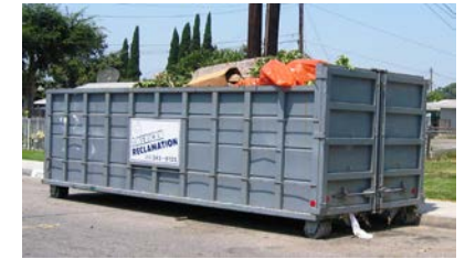
40 Cubic Yard Container

Recycling rental bins and roll-offs are available for wood, green waste, concrete, asphalt, cardboard, metals, and other recyclable materials.