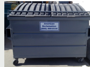
3 Cubic Yard

Size = 71" W x 30" H x 30" D Maximum weight = 380 lbs