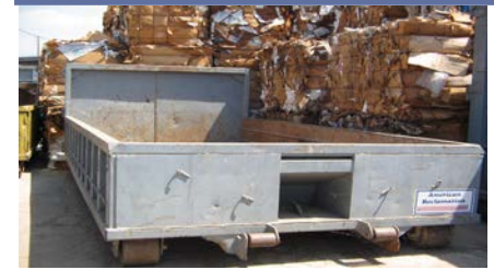
Lowboy (10-16 Cubic Yard): holds concrete, dirt, asphalt, tile and stone.

Street Use Permit: Customers need to contact their local municipality or the County of Los Angeles for unincorporated areas to obtain a permit to place container on a right-of-way or public street.